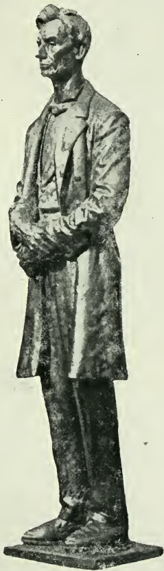
BARNARD'S STATUE OF LINCOLN.